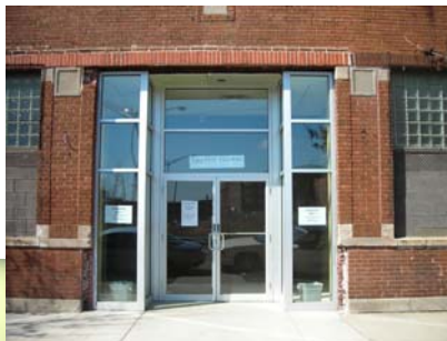
New Front Entrance

Clean Streets is contributing to the monthly support of the Teaching Factory. What a display of God's provision!