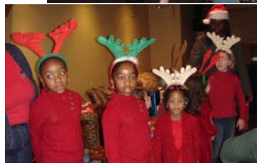
Breaking Ground Family Christmas Party December 2007