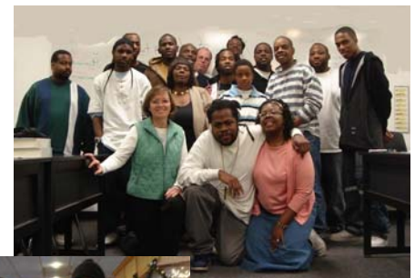
Teaching Factory Graduates Class of December 2007

Teaching Factory Manufacturing Training Center Men and Women's Valid Concern Teaching Affordable Housing Clean Streets Minority Contractor's Coop Discipleship House